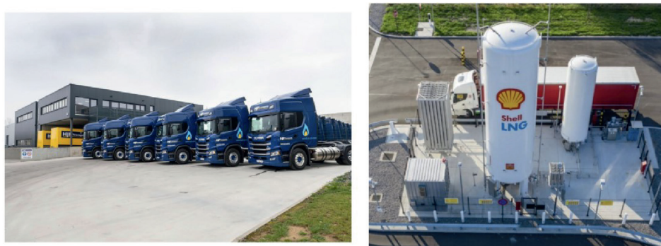
Figure 3. HJT vehicle fleet and Shell LNG plant (source: [46]).

externalities at a country level has been adopted and refined by large EU-funded projects and applied in reports for the UK Commission for Integrated Transport. Furthermore, the LRC's research scrutinised CO 2 emissions from road haulage operations, prompting methodological changes in compiling CO 2 data for the National Atmospheric Emissions Inventory. The research demonstrated that decarbonising the road freight sector might be less challenging than anticipated. Notably, the LRC's work has influenced industry practices, government policies, and international initiatives, showcasing its multifaceted and profound impact on the road freight sector's journey towards decarbonisation.