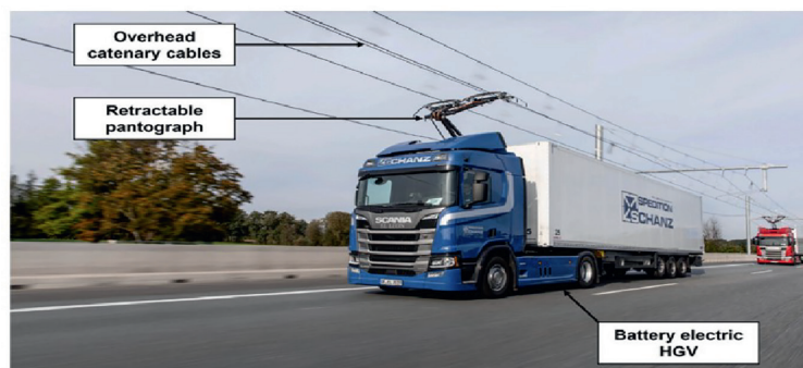
Figure 4. An overhead catenary implementation of ERS.

The future policy landscape is expected to introduce stricter global emission standards for road freight vehicles, fostering the adoption of cleaner technologies and penalising carbon-intensive practices [26]. Governments are likely to provide increased incentives and subsidies for the transition to low-emission and zero-emission vehicles, particularly in areas like fleet electrification, charging infrastructure