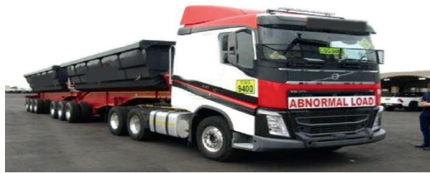
Figure 2. Interlink transport coal in the PBS pilot project (source: [45]).

Vehicle manufacturing and maintenance are integral to road freight's carbon footprint. Energy-intensive production processes and material extraction contribute to emissions. Life cycle assessment (LCA) studies, such as Hawkins, Singh [24], provide insights into the environmental impact of manufacturing. Material selection and lightweighting strategies inform emission rates [25]. Efficient maintenance practices, including predictive maintenance, can reduce emissions [27]. Circular economy principles in manufacturing and maintenance optimise designs for longevity and recycling, mitigating environmental impact [28]. Decarbonising road freight involves a shift to electric vehicles, with the [7] highlighting their manufacturing and maintenance efficiency. Optimising manufacturing processes and embracing sustainable maintenance practices contribute to a more environmentally sustainable road freight industry.